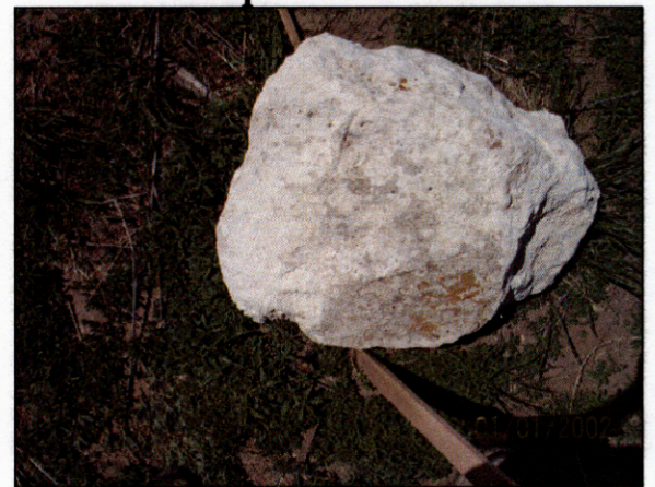
5/8" rebar found under rock